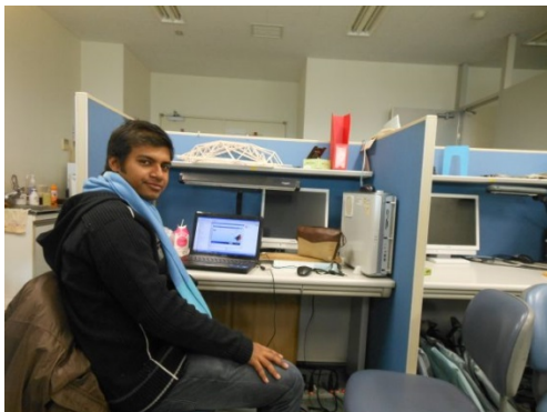
During research activity