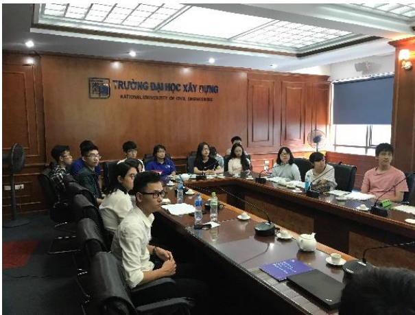
(3) Presentations by SU students (3/3)