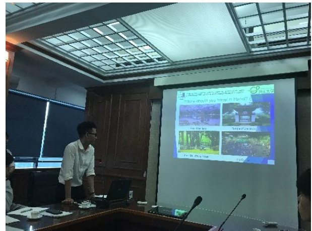
(4) Presentation by NUCE students