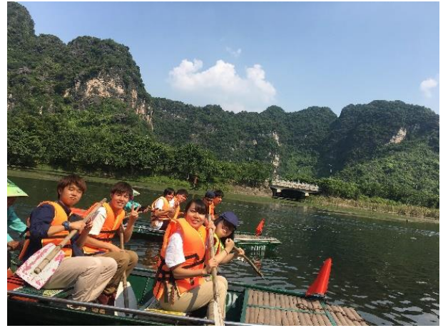
(12) Group tour for Trang An (3/3)