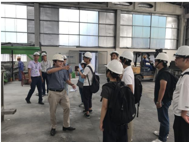
(9) Visit to Xuan Mai Precast Concrete Plant (3/3)