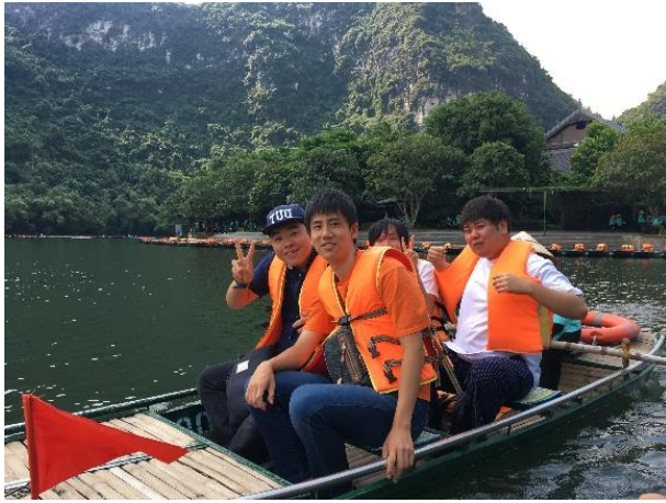
(11) Group tour for Trang An (2/3)