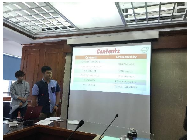
(2) Presentations by SU students (2/3)