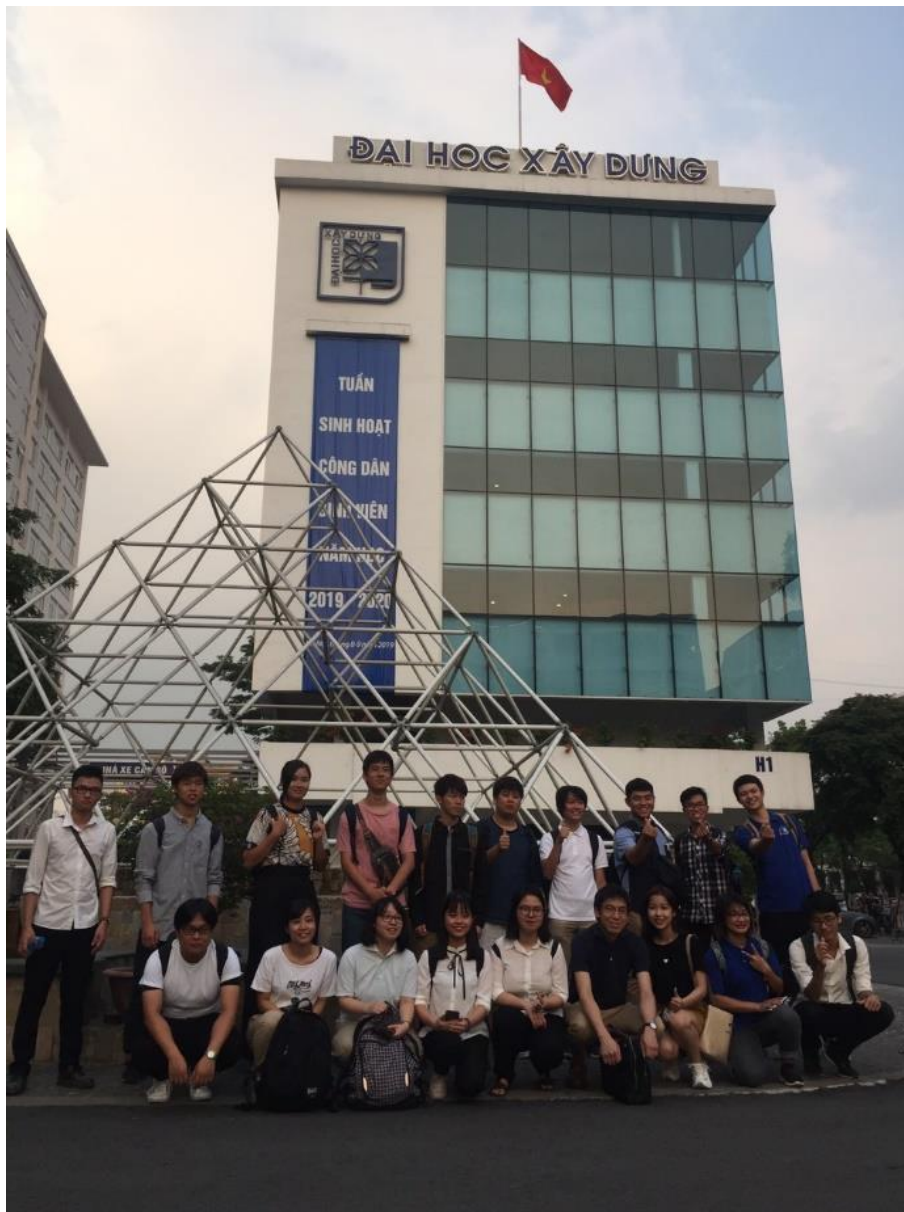
(13) NUCE-SU team photo session