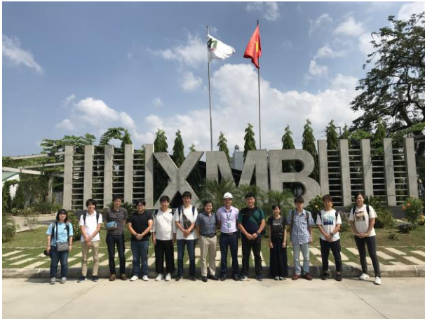
(7) Visit to Xuan Mai Precast Concrete Plant (1/3)