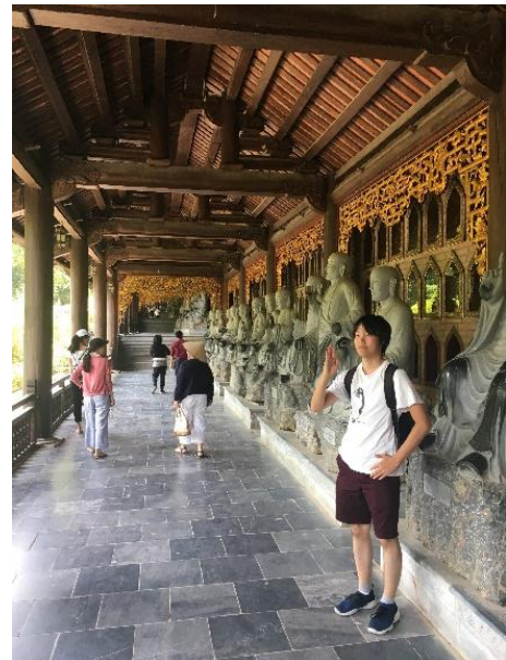
(10) Group tour for Trang An (1/3)