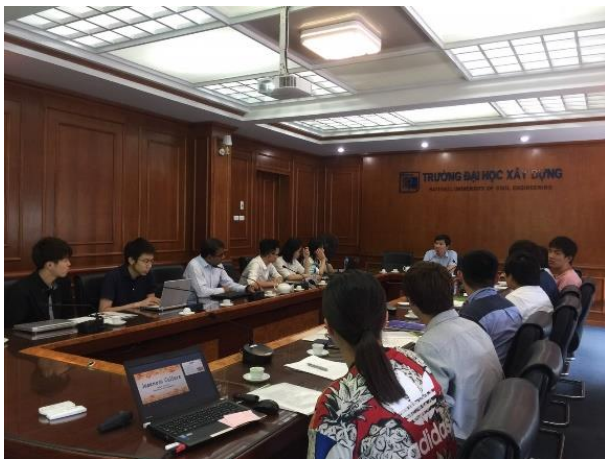
(1) Presentations by SU students (1/3)