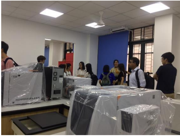
(5) Campus Tour (1/2)