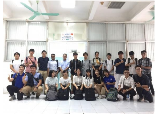
(6) Campus Tour (2/2)